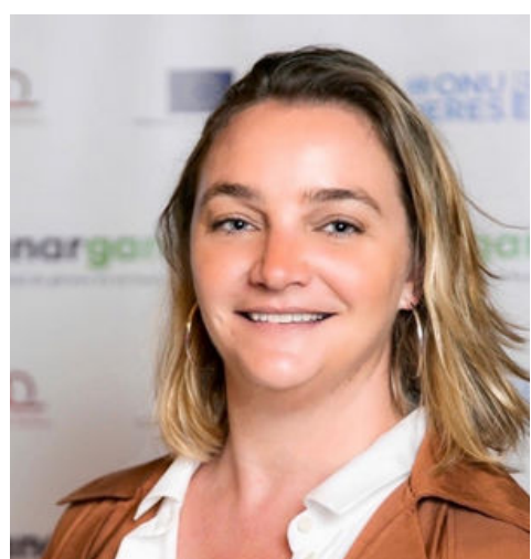
Florence Raes Director of UN Women Brussels Liaison Office

The film will be followed by a panel discussion, in the presence of: